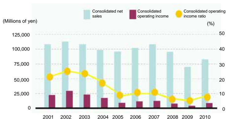
Changes in consolidated net sales, consolidated operating income, and operating income ratio