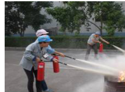
Fire extinguishing training (Guangdong Mabuchi)