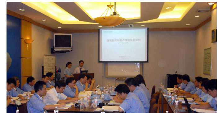
The 9 th Environmental Managers Conference (Dalian Mabuchi)

At the conference, the Environmental Managers discussed how to completely eliminate use of environmental burden causing substances and strengthen the rigorous management system. They also exchanged opinions on the positive aspects of our business, or how we can create a new environmental value, under the theme of business-centered reforms.