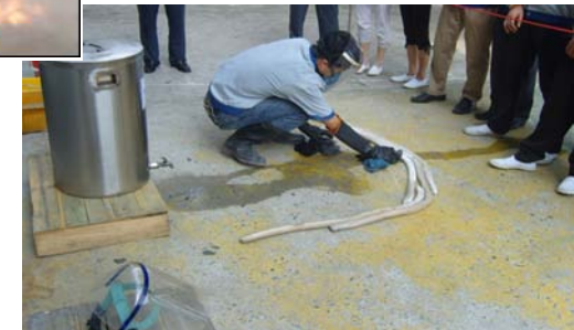
Training on how to deal with leaked chemical substances (Guangdong Mabuchi)