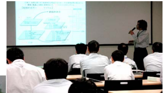
Education on the environmental management system (the Head Office)

With a strong awareness that taking environmental responses is a mission of both individuals and companies, the entire Mabuchi Group is continuously conducting environmental education and training to enable actions on our own initiatives.