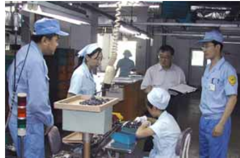
Environmental audit by an external audit body (Dalian Mabuchi)

We will continue to appropriately operate and improve the environmental management system.