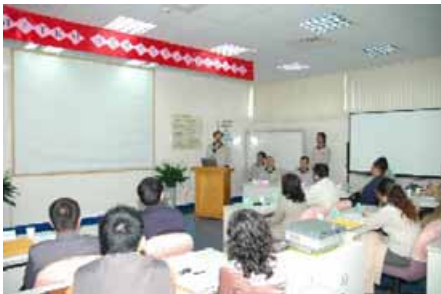
Explaining our green procurement system to suppliers (Taiwan Mabuchi)

We in the Mabuchi Group will continue to promote green procurement so that we can always produce environmentally friendly motors.